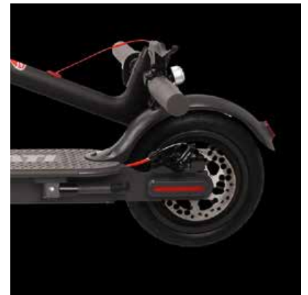
Rear disc brake